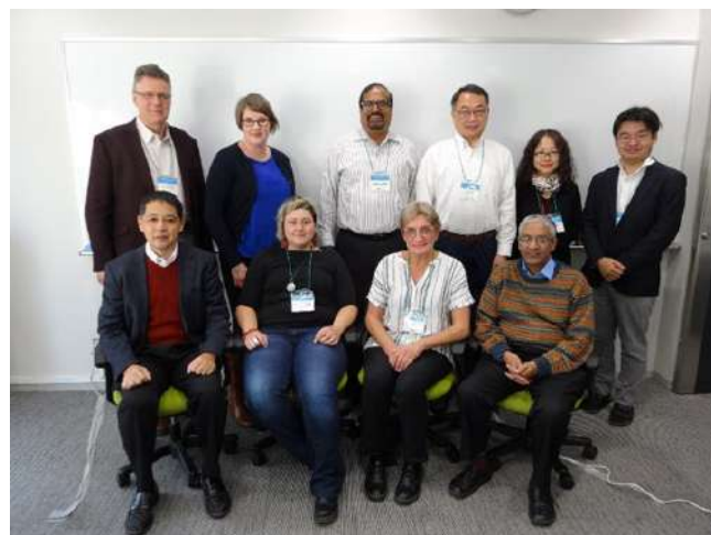
Figure 1. Participants of the VarSITI Summarizing Workshop.

VarSITI Summarizing Workshop was held as an ISEE/CICR international workshop in ISEE, Nagoya University on November 11-15, 2019. This workshop was designed to summarize the 5-year scientific achievements of the SCOSTEP's VarSITI (Variability of the Sun and Its Terrestrial Impact) program ( http://www.varsiti.org/ ) of 2014-2018. Ten scientists (project co-leaders and working group leaders of VarSITI) were joined from Bulgaria, Canada, China, Croatia, Japan,