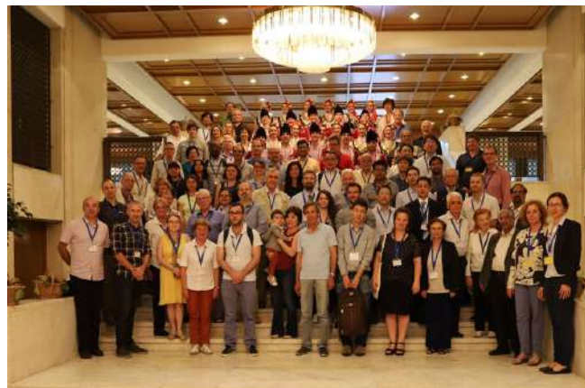
Figure 1. Group Photo of Participants.

The VarSITI Completion General Symposium was held in Sofia, Bulgaria from 10 to 14 June 2019. It was attended by 98 participants from 24 countries. The symposium covered the following topics: