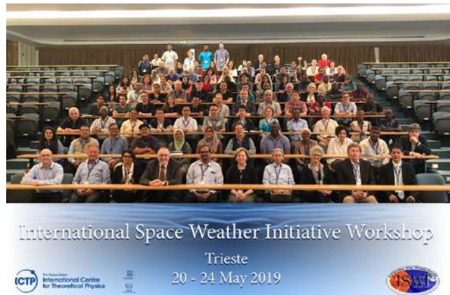
Figure 1. Group Photo of Participants.

ISWI, established in 2009, has proved to provide a framework for collaboration between teams of scientists, serving as an example of remarkable international work in instrument operation, data collection, analysis and publication of scientific results. ISWI has established a platform for bottom-up approach in order to produce space weather literate communities, particularly developing nations, and to work together as a network sharing ideas, information and data, and to create joint projects.