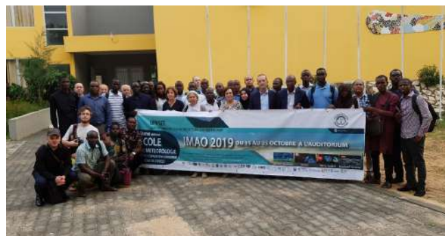
Figure 1. Group Photo from IMAO Workshop.

The IMAO 2019 Space Weather School aimed to strengthen the capacities of young researchers, Master 2 students and PhD students from the Maghreb and West Africa in all the scientific disciplines concerned by 'Space Weather'.