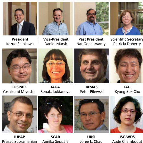
Figure 1. The 2019-2022 SCOSTEP Bureau.